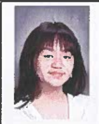
8 th grade