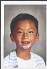
6 th grade