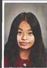
6 th grade