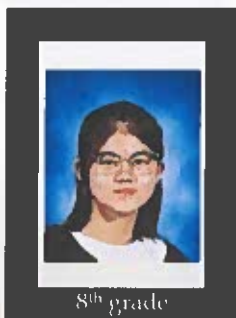
8 th grade