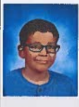
7 th grade